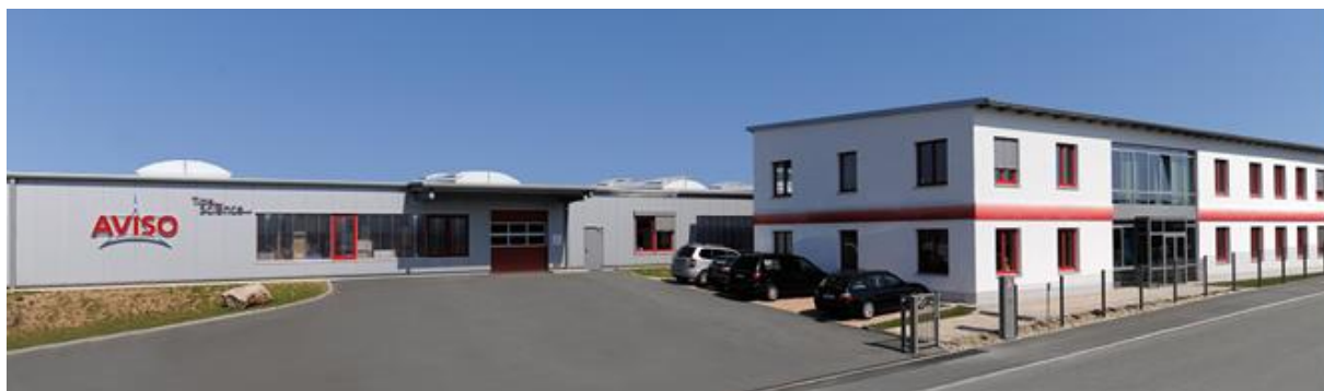
ALS headquarters in Jena, Germany

ALS Automated Lab Solutions GmbH is located in Jena, a dynamic city famous for microscopy and material science. ALS is a specialist for the development of innovative technological solutions for cell biology research and molecular biology. ALS lifts cell culture to a new level of choice and control on the leading edge in cell biology, cell therapy research, regenerative medicine and drug discovery. With automation and standardization of laborious manual procedures, ALS supports science and research for more efficiency and the creation of new methods for the science of tomorrow.